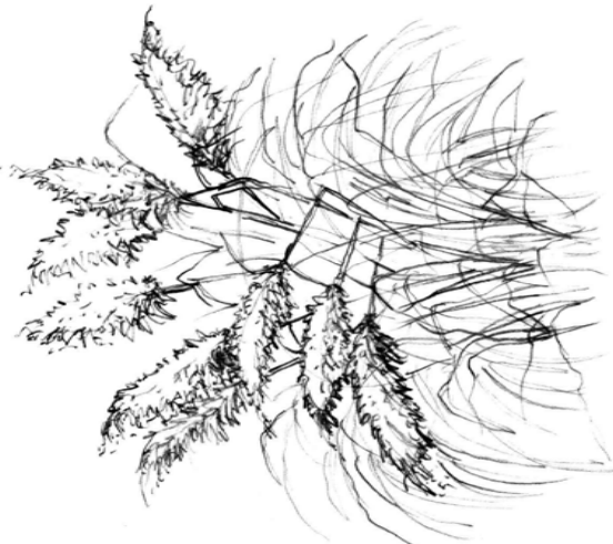
TALL GRASS PAMPAS GRASS

Fire Safe Treatment Trim low hanging branches up to 10 feet.